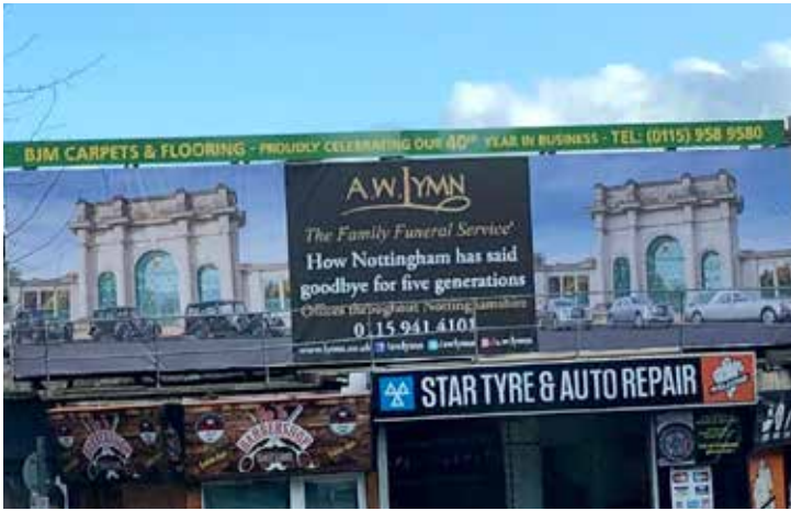
Have you spotted our latest billboard? If there are any sites which you think maybe appropriate, then please get in touch with Emma.