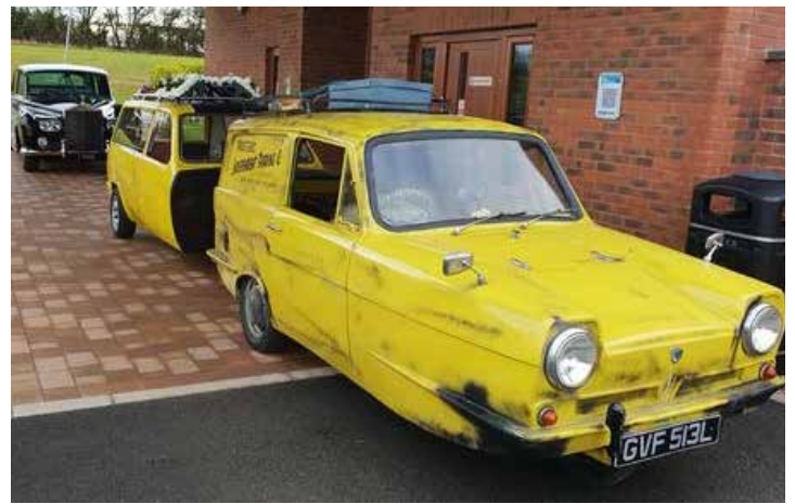
Joyce was pleased to be at Aspley and see 'Only Fools and Hearses' in real life!