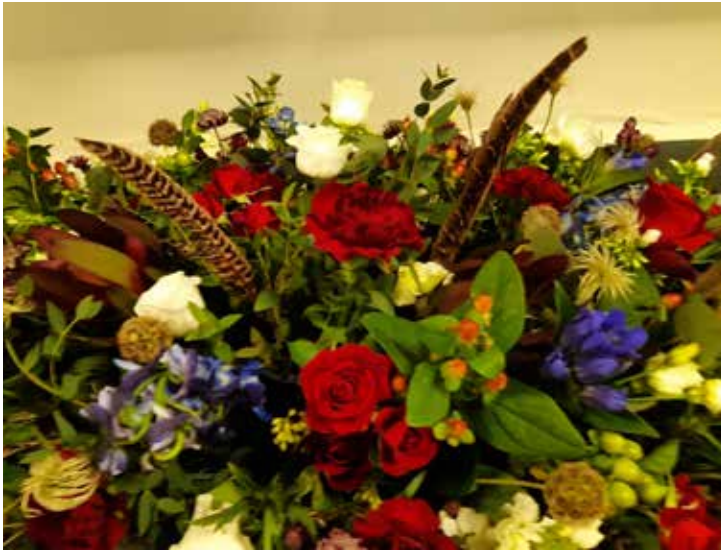
This beautiful floral arrangement was personalised with pheasant feathers.